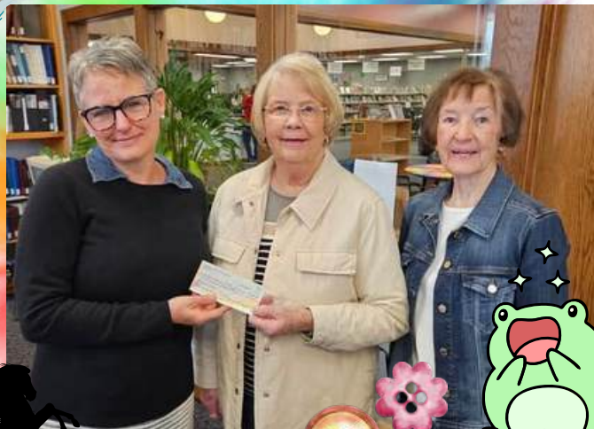
THANKS! Thanks to our Friends of the Library for a generous donation to the library!