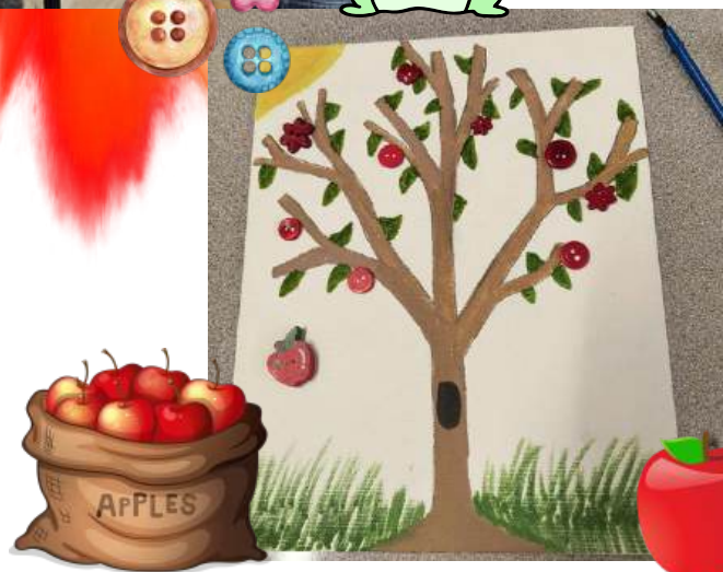
Our outreach program at Bruce Normile gave way to this gorgeous apple tree!