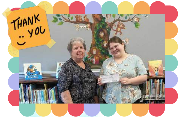
Thank you to Alliant Bank for giving us a kind donation!