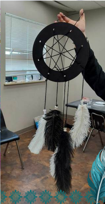
Take a look at this lovely craft that was a product of our teen outreach at Preferred!